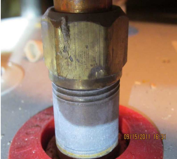
PHOTO NO. 18 ELECTRIC A/C - FURNACE IN ATTIC AREA