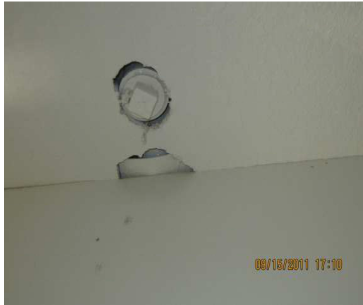
GAPS AT SEWER LINES UNDER BATH SINK